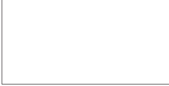
45.25" x 90.75"