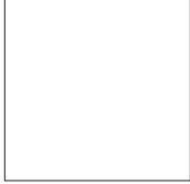
47" x 48"

gloss or chalkboard finish. In minimalist fashion, Aura is frameless with defined corners and sits slightly off the wall, adding a dose of character to any workspace.