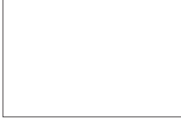
47" x 72"